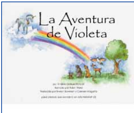
Concepts About Print